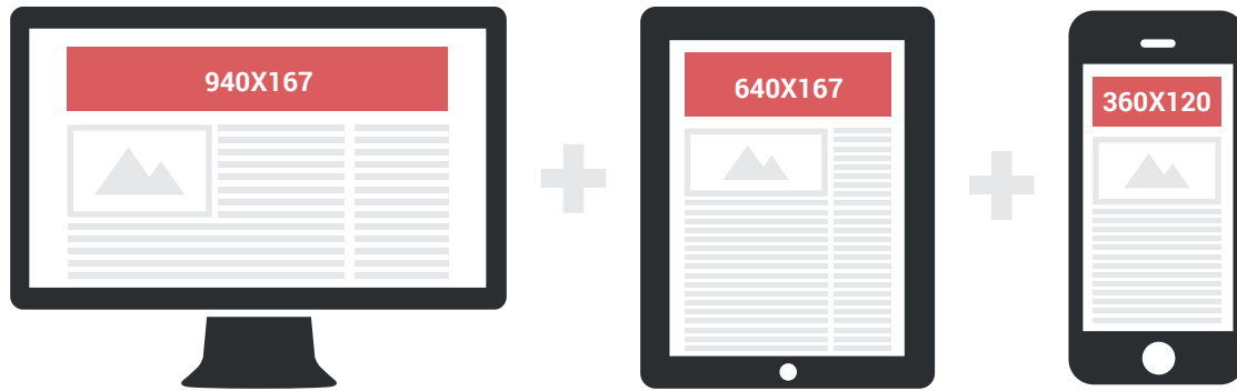
ROS MOVIE BANNER : 21€ CPM